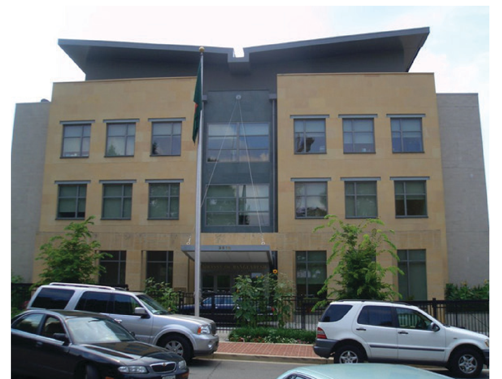
Embassy of Bangladesh at the ICC