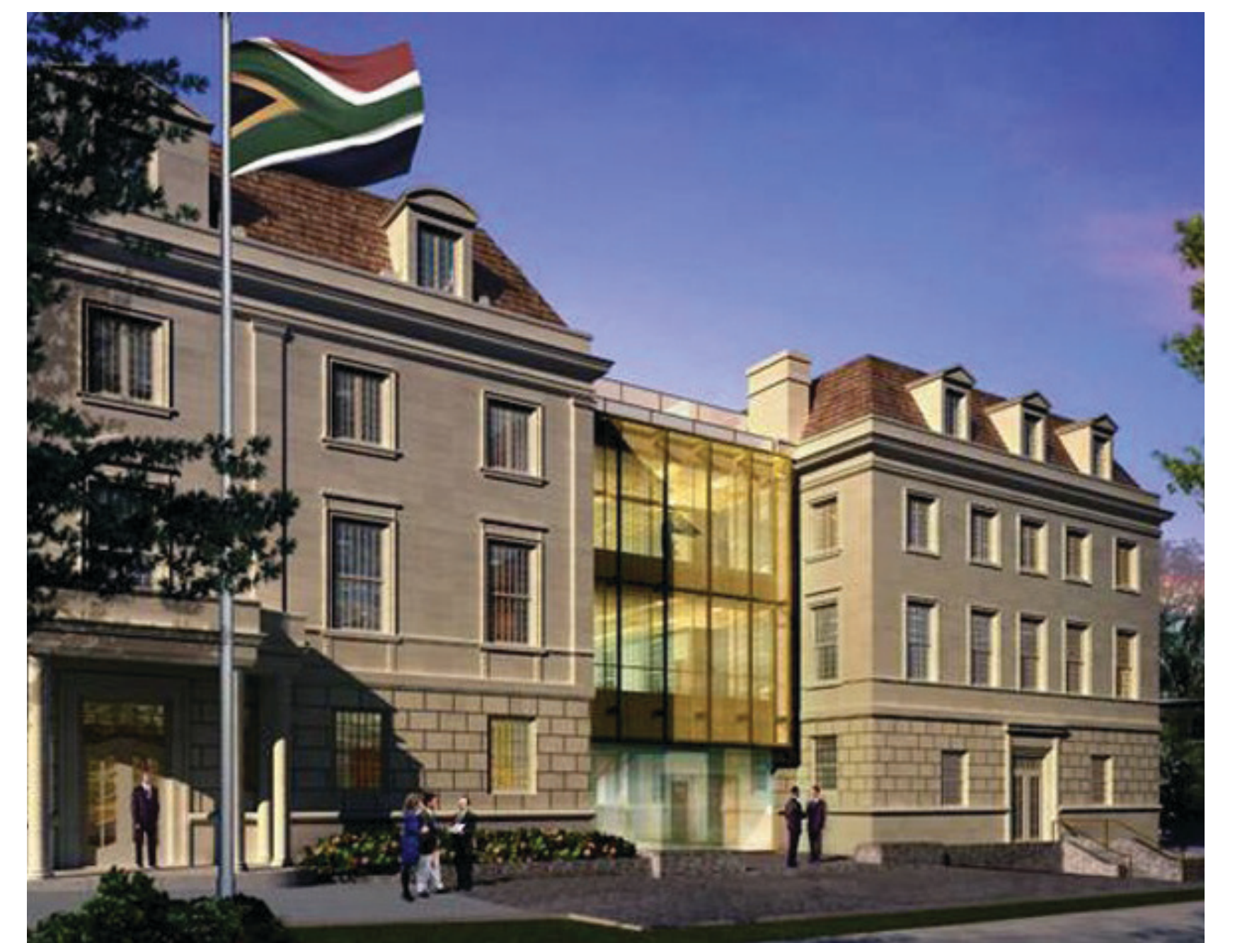
Embassy of South Africa on Mass. Ave

A chancery is the principal offices of a foreign mission used for diplomatic or related purposes, and annexes to such offices (including ancillary offices and support facilities), and includes the site and any buildings on such site which is used for such purposes.