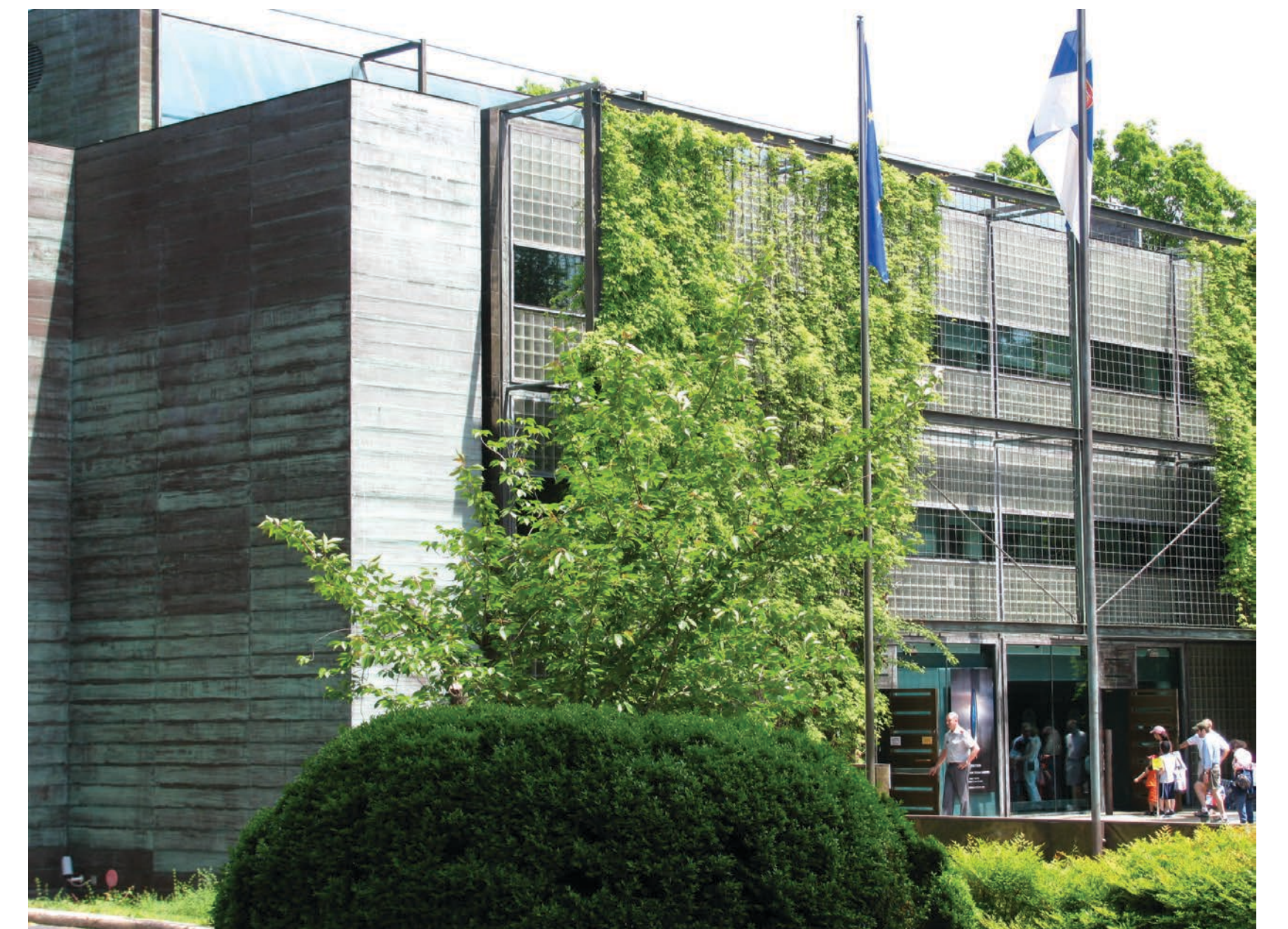
Embassy of Finland on Mass. Ave

A foreign mission is any mission to or agency or entity in the United States which is involved in the diplomatic, consular, or other activities of, or which is substantially owned or effectively controlled by a foreign government, or an organization representing a territory or political entity which has been granted diplomatic or other official privileges and immunities under the laws of the United States or which engages in some aspect of the conduct of international affairs of such territory or political entity, including any real property of such a mission and including the personnel of such a mission.