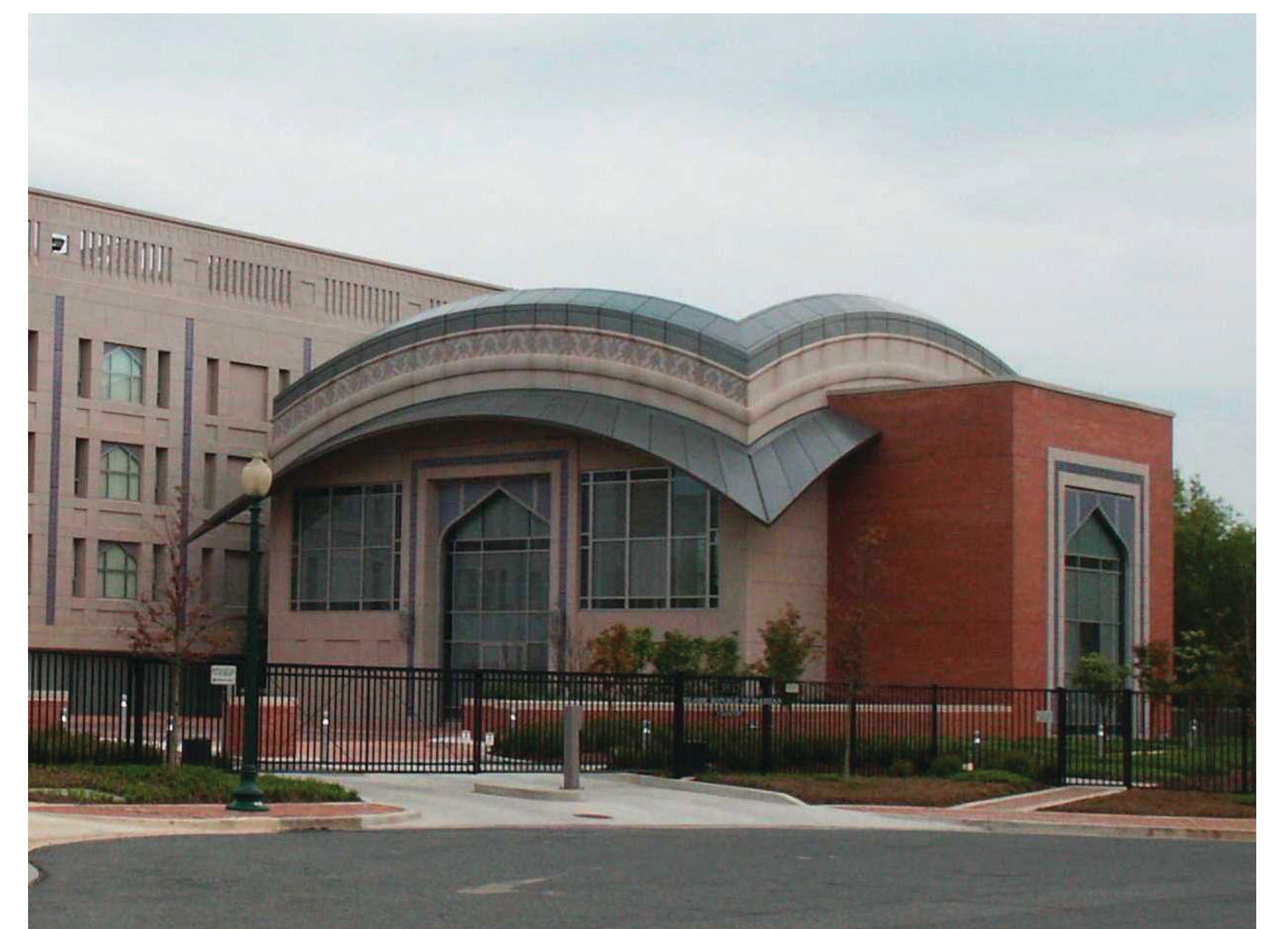
Embassy of Pakistan at the ICC