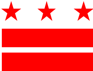
Vincent C. Gray Mayor